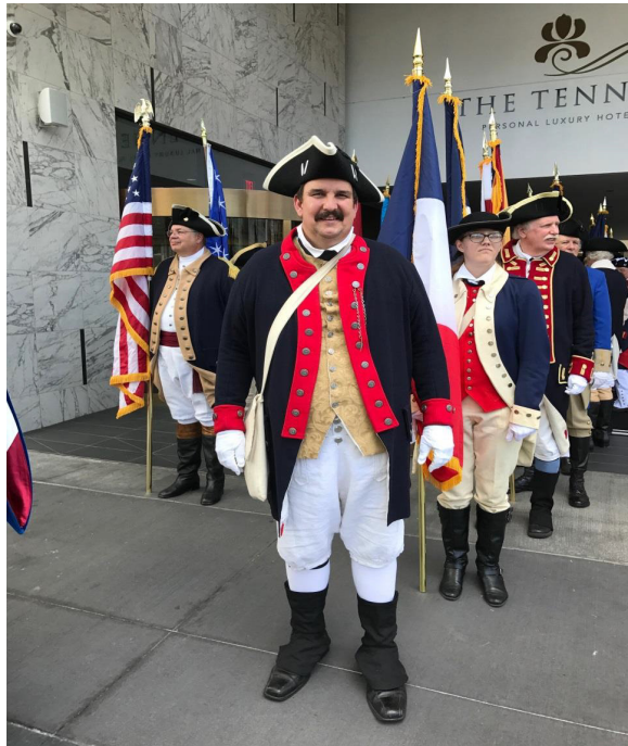
The National Color Guard assembles to proceed to the memorial service