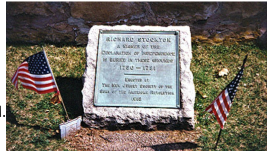
Richard Stockton Medallion