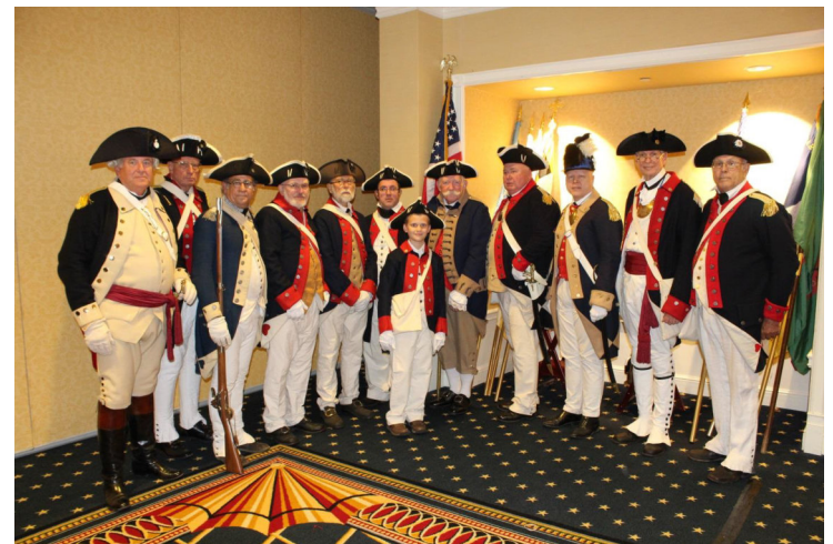
This year the AMS Color Guard recruited a CAR member to join them.