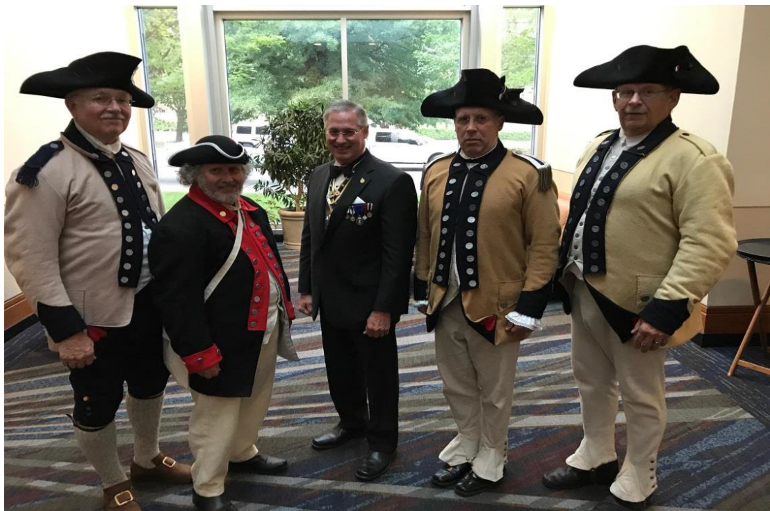
New Jersey had 5 Compatriots attend the Annual Congress in 2017, with 4 participating in the National Color Guard.