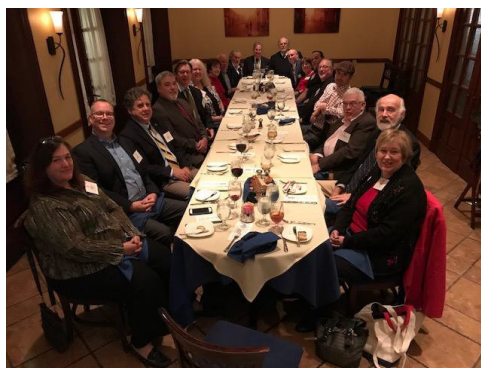
Fall Meeting Mosaico Restaurant