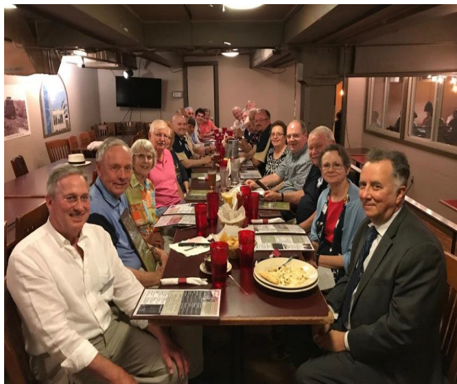
New Jersey and Delaware Societies enjoy their traditional dinner during the Annual Congress in Knoxville TN. July 2013