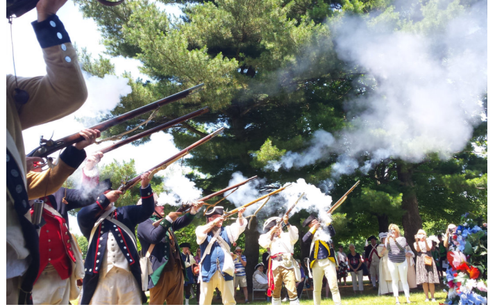
Honor Guard Salute during von Steuben ceremony.