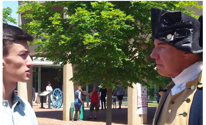
"Young man you remind me of the Marquis"