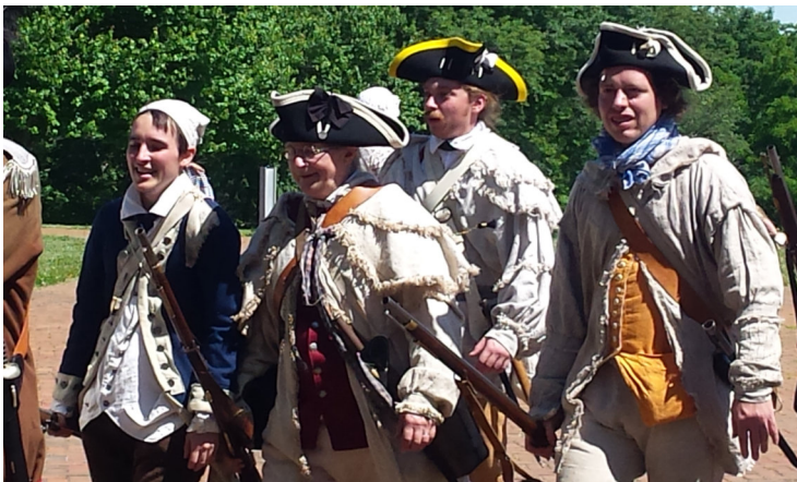
Patriots on the move.