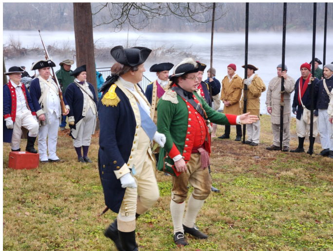
General George Washington and his commanders inspecting troops prior to crossing